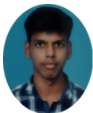
AJAY II - IT (A)