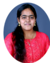
VARSHA IV- IT (B)