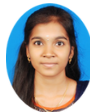
KANIMOZHI V III - IT (A)