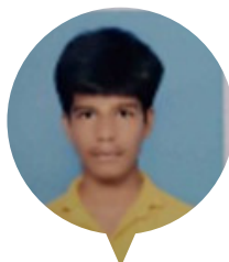
GOWTHAM S II IT B