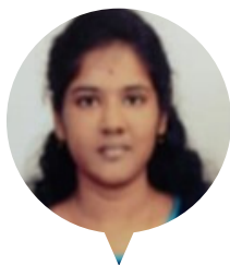
UMAYAL M II IT B